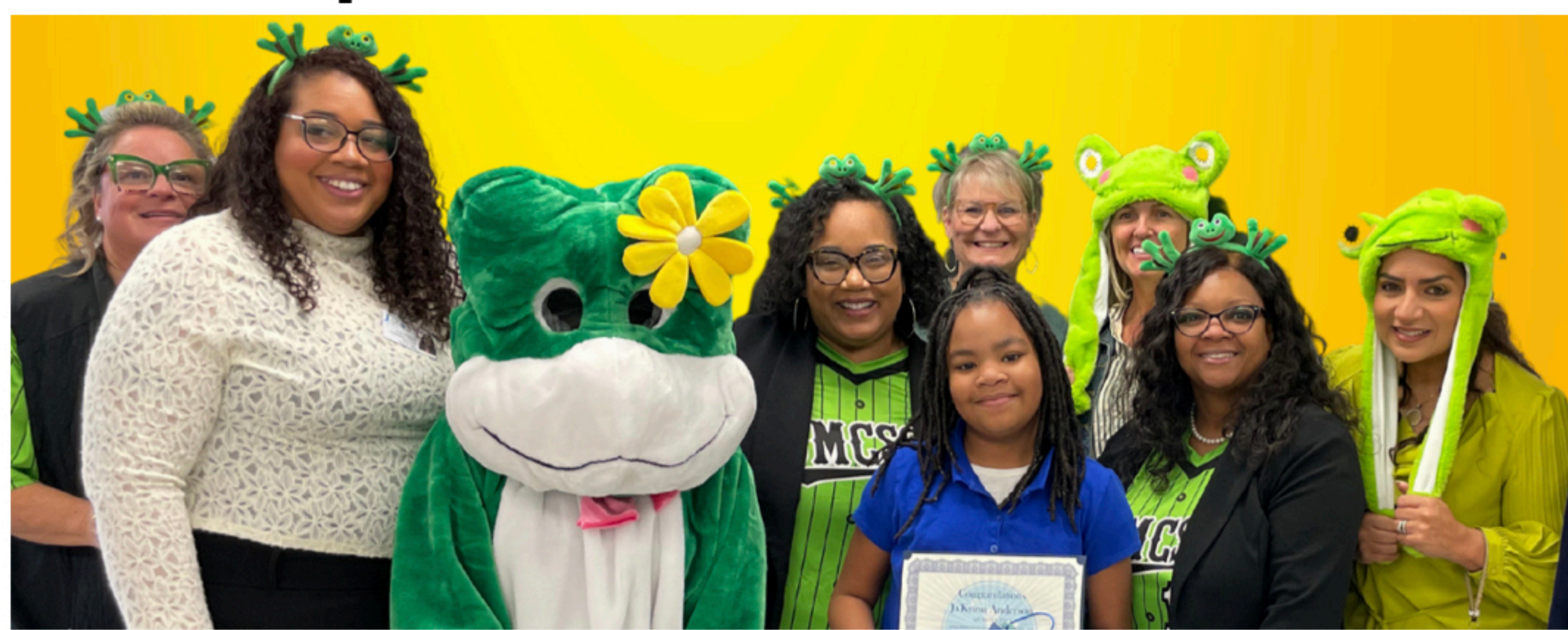
Lily debuta en Read Across America y Leap Up for Literacy

L as Escuelas del Condado de Jackson-Madison (JMCSS) se complacen en presentar a Lily, la Rana de la Alfabetización, ¡nuestra nueva mascota motivadora para Leap Up for Literacy! Lily debutó durante la Semana de Read Across America, visitando varias escuelas para animar a los estudiantes a experimentar las alegrías y los beneficios de la lectura. JMCSS invita a todos los estudiantes a unirse a Lily leyendo al menos