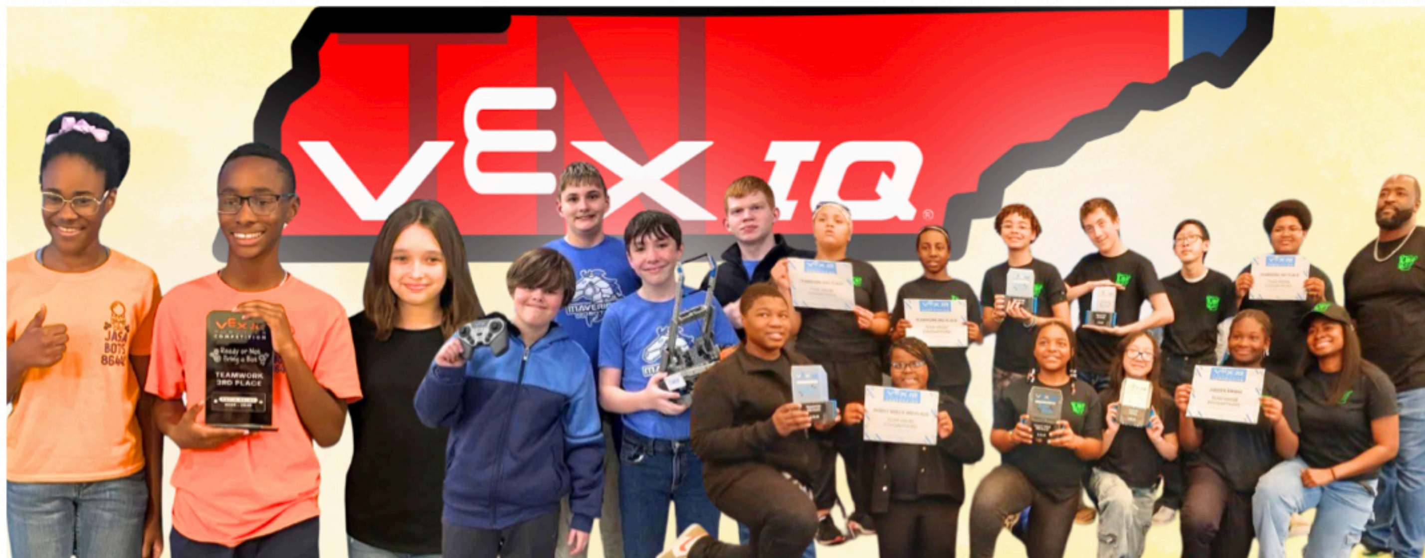
JMCSS representado en el Campeonato Estatal por tercer año consecutivo

J ackson Academic STEAM Academy, JCM Middle y Community Montessori se han clasificado para competir en el Campeonato Estatal de Robótica VEX IQ de Escuelas Intermedias de 2025 en Hendersonville, TN. A través de partidos de torneo, desafíos de codificación y conducción de habilidades, cuadernos de ingeniería